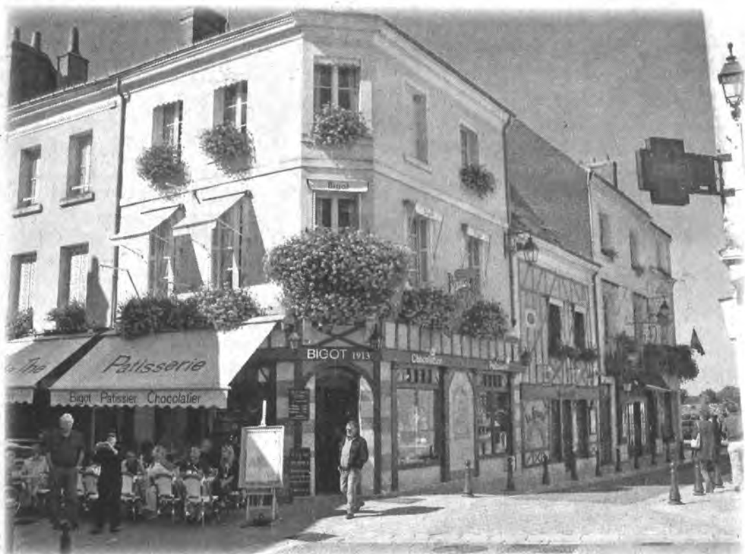
The charming village of Amboise.

We spent three nights in Honfleur, two nights in Bayeux, two nights in Mont-Saint-Michel, four nights in Amboise and the last night at a former hunting lodge in the CDG airport area.